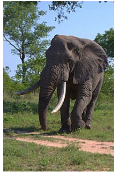
A magnificent bull elephant with massive tusks!

Elephant sightings have also been exceptional with the herds returning "en masse". Regular sightings from the deck at the lodge have kept us entertained during the hot hours of the day.