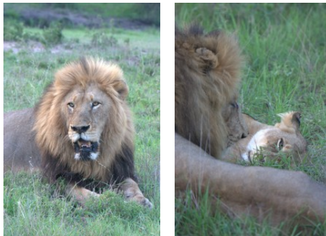
A Kahuma Male Lion on his own & mating with an unidentified female.

Lion sightings have been absolutely amazing. The five big Mapogo males have been in and out of the area each and every day of the past two weeks. Usually this would result in a decline in other lion sightings, as the rest of the lion population flee from the threat that "the big guys" pose to them. But not this time! Regular sightings of the Styx pride have been recorded - we were rewarded with a sight of them playing on two occasions. The Chilala pride has also been back in the area and was very obliging to our guests and their cameras when they brought down a wildebeest in front of our vehicles.