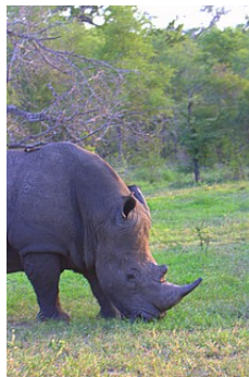
A rhino grazing near the lodge

It is difficult to capture the magnificence of what we experience in the bush at Arathusa every day. We can only hope that this diary goes some way towards bringing the safari experiences to you via the cyber environment. It has been a special two weeks – we look forward to what December will bring.