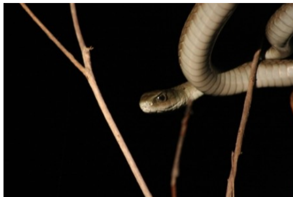
The very venomous boomslang ("tree snake")

Another two great weeks have come and gone in the bush of the Sabi Sand Game Reserve. With amazing sightings around every corner, we never know what to expect when we leave the lodge in the morning and evening.