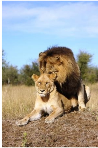
Mapogo Male with female

We struggled with lions for a few days, but once they came back, they were everywhere. We had all the Mapogo male lions pairing up with lionesses from the Kahuma pride and the Styx pride. Still no cubs from the pairings in December, which is a little disappointing.