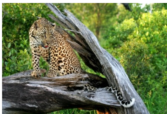
One of Karula's cubs

Leopards have been great as usual and we have had some awesome sightings. We had six different leopards on our drive the other night ..... where else can you do this? One of the amazing sightings we had in the past couple of days was Mafufenyane (dominant male), Karula (daughter) and her two cubs all sharing the same kill. The cubs aren't his and so we were all worried that he would kill them, but all they got was an occasional growl when they got too close while he was feeding.